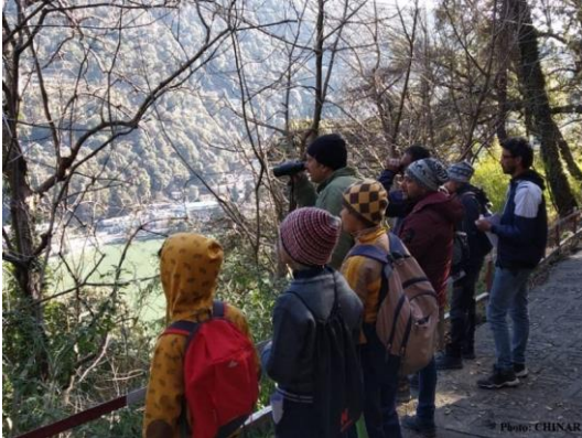
CHINAR facilitates youth education in Uttarakhand