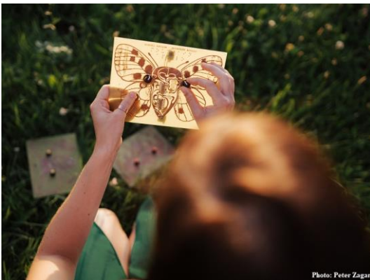
Sounding the mountain butterflies in Slovenia