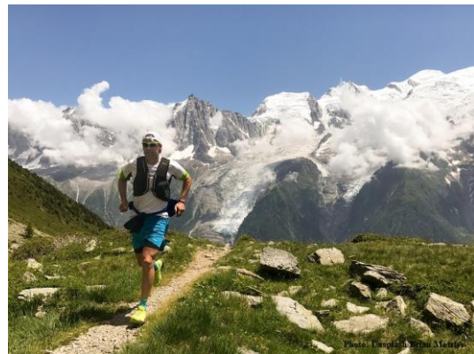
Mountain and volcano race supports parks and tourism